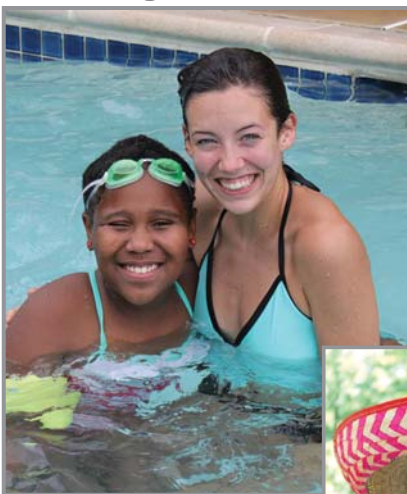
Swimming and Fiesta Fun Day are two of Kaliste's favorite memories of Summer Camp at Eagle Lodge.