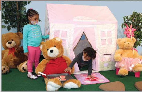
Oops! Looks like somebody got caught sneaking a cookie from Mama Bear!

After being separated into two smaller groups for almost a year, our Sunshine Preschool kids were very excited to get back together with all their friends starting Valentine's week.